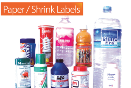
Paper / Shrink Labels