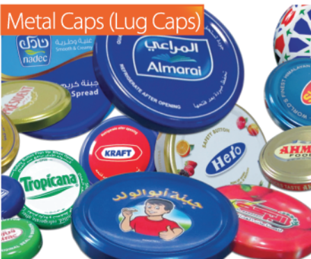
Metal Caps (Lug Caps)