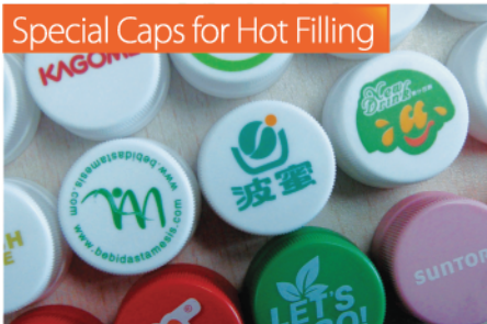
Special Caps for Hot Filling