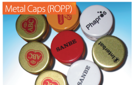
Metal Caps (ROPP)